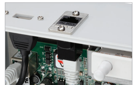
PIM400-1501-LC has RJ-45 and USB external connectors to make installation easy.